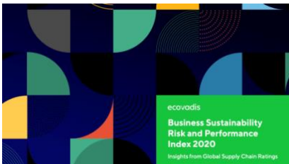
Performance in Key Sustainability Themes

The report concluded that overall company supply chain sustainability efforts around labor, ethics and environmental (CO2 emissions) have progressed. However, sustainable procurement (which measures two factors: suppliers' environmental practices and supplier's social performance on labor rights and other worker issues) still lags behind and worsened in 2019 (Diagram below)